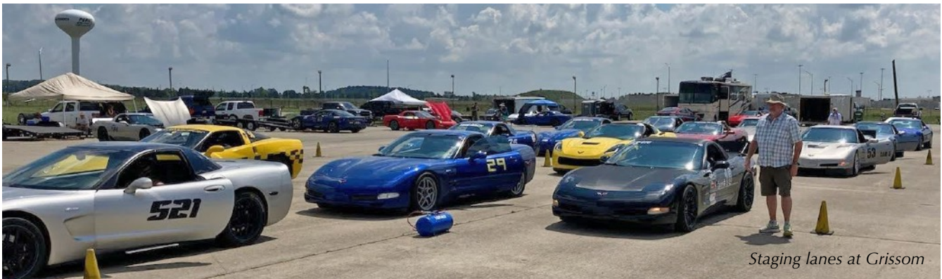
Staging lanes at Grissom