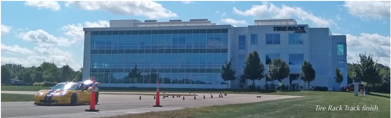
Tire Rack Track finish

two days I corded both of them. He was good about saying bye to his four year old tires. It only cost me two cases of beer. I can do beer!