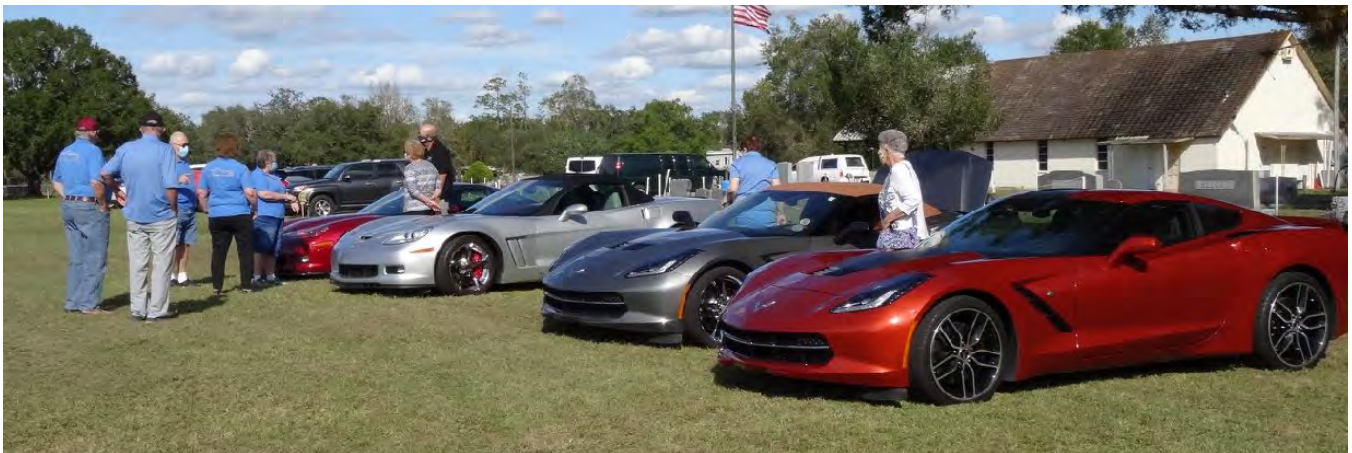
CKCC members pay their respects at graveside services in Christmas, Florida.