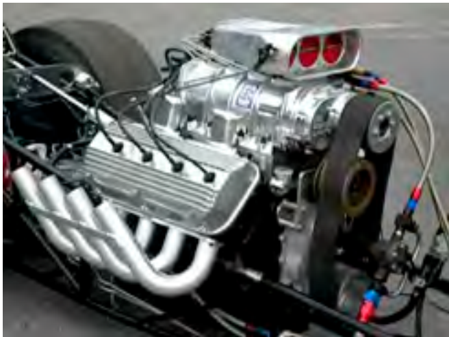
392 Hemi Race Engine