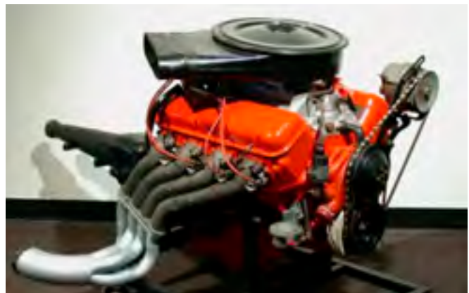
Chevy Mystery Engine