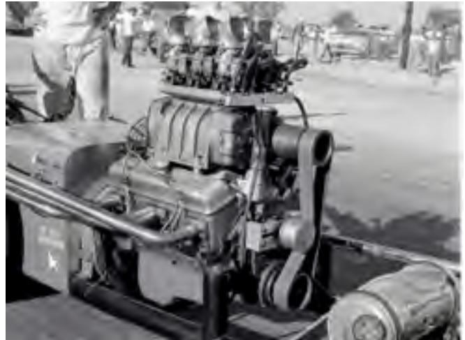
283 Chevy Race Engine

The Chevy guys capitalized upon that and since the old wives tale that an elephant was afraid of a mouse and the Chevys were much smaller (in size) than the Hemi, the name "Mouse Motor" was born.