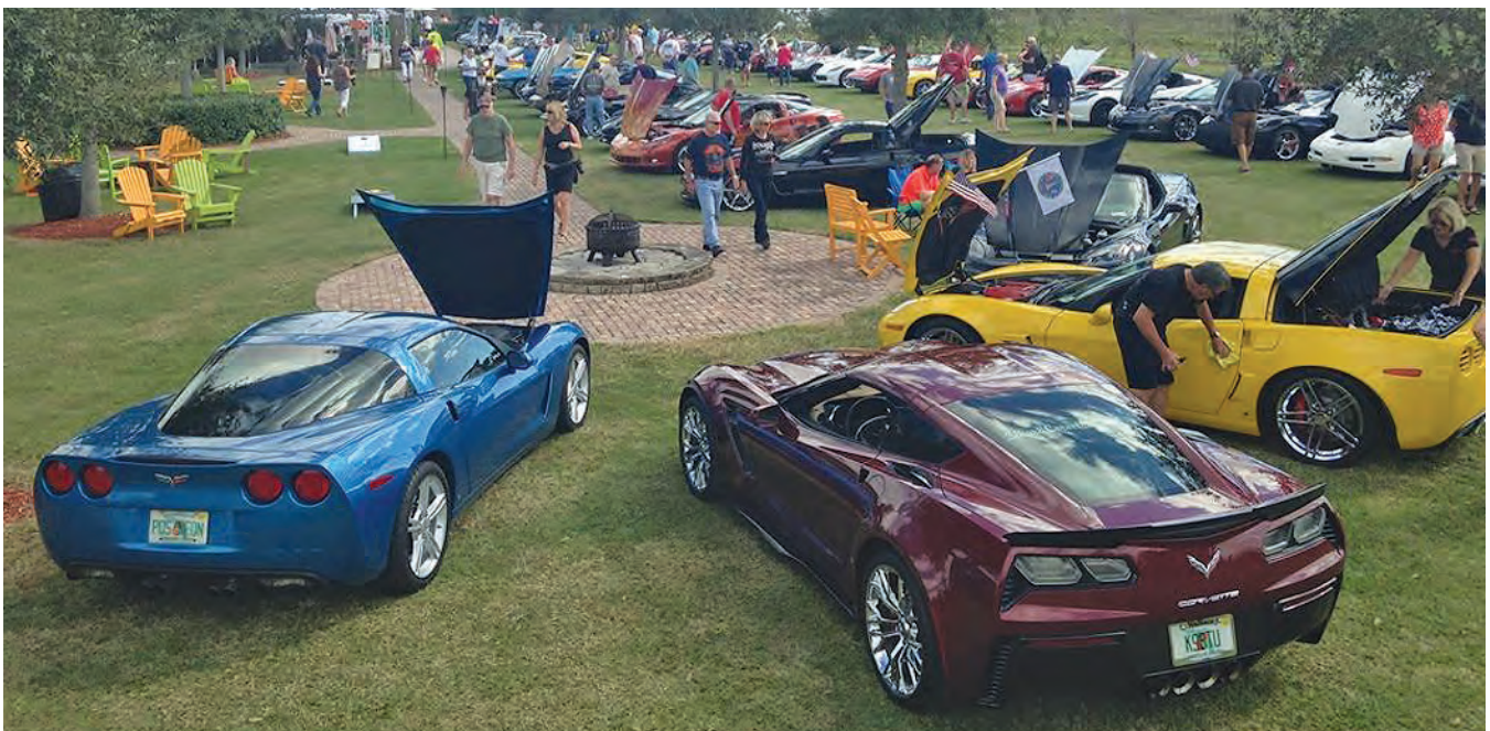
Photo of a previous show

P.S. Perhaps our car club can run down there on another weekend as they have live bands just about every weekend.