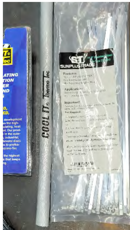
The thermal insulation and stainless tie wraps used for the transmission fluid and engine oil cooling lines that were in contact with the header tubing.