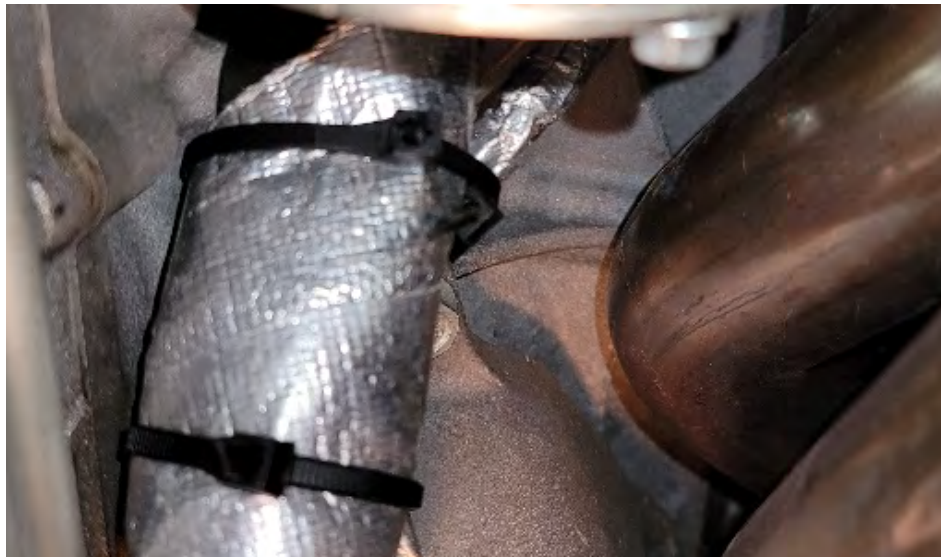
Photo 5 – Starter control wires tie wrapped to main battery cable insulation.

Since addressing each of these issues, I have autocrossed the C6Z three days (21 events) and had no issues with the car. I inspected the headers and tubing/wiring each day after racing and have found that all fixes are holding up well.