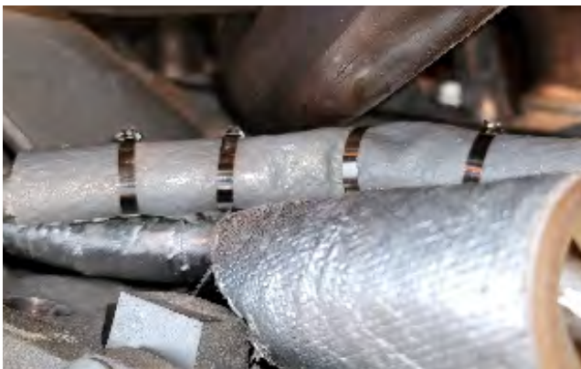
Top photo: Transmission lines and Bottom: Engine oil lines with air gap clearance and insulation.