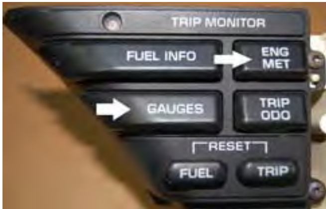
C4 Trip Monitor

To reset the C4 Corvettes , again the key must be in the "ON" position with the engine off. Press the "ENG MET" button on the trip monitor. Within 5 seconds press it again. Within 5 seconds press the "GAUGES" button and hold. The "CHANGE OIL" light should flash. Hold the "GAUGES" button until the "CHANGE OIL" stops flashing and goes out. It is now reset. Turn the key off and you have finished the process. C1 thru 3 Corvettes have a manual OLM system and requires more effort. First locate the oil change reminder sticker. This could be located on the inside driver's door jamb or on the windshield in the upper left corner, on the rear portion of the driver's door or under the hood.