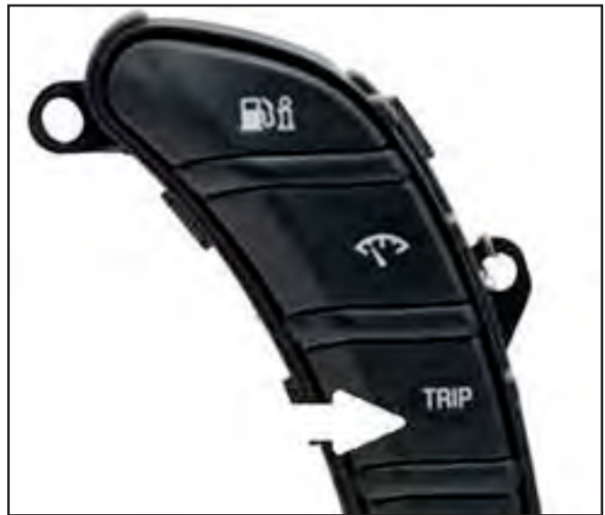
C6 Trip Button

the “TRIP” button on the instrument panel. Scroll thru the pages on the DIC to the Remaining Oil Life % is displayed. Press the Reset button until it shows 100% and release the button.