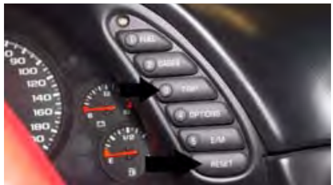
C5 Driver Info Switches

There is a bit more activity required for the C5 models. The key must be in the “ON” position but again the engine should be off. Press the DIC “TRIP” button to display the “OIL LIFE %