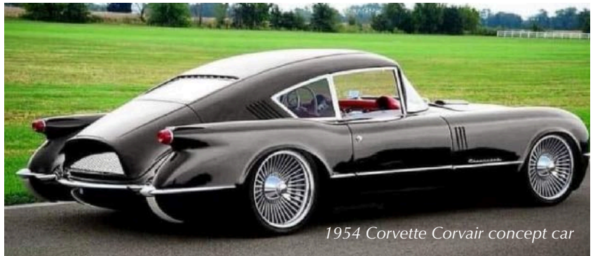
1954 Corvette Corvair concept car

More than once, Chevrolet designers have toyed with the idea of a four/five-place Corvette.