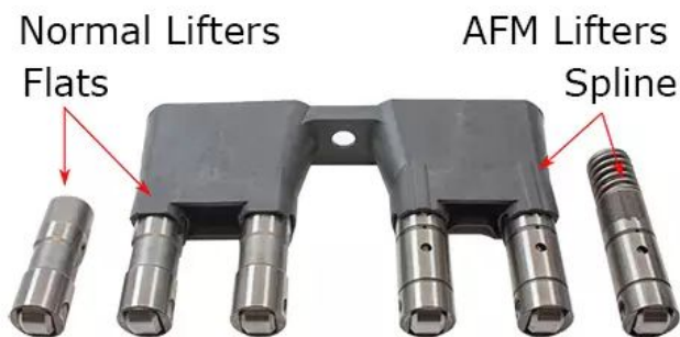
Figure 3 – Lifters and Lifter Trays

The LT1 Lifters and Lifter Trays for the AFM cylinders (1, 4, 6 and 7) are taller and have special oil passages to allow the valves to be disable by the AFM system. Engines with AFM also have a special camshaft, a high-volume oil pump and a pressure relief valve in the oil pan.