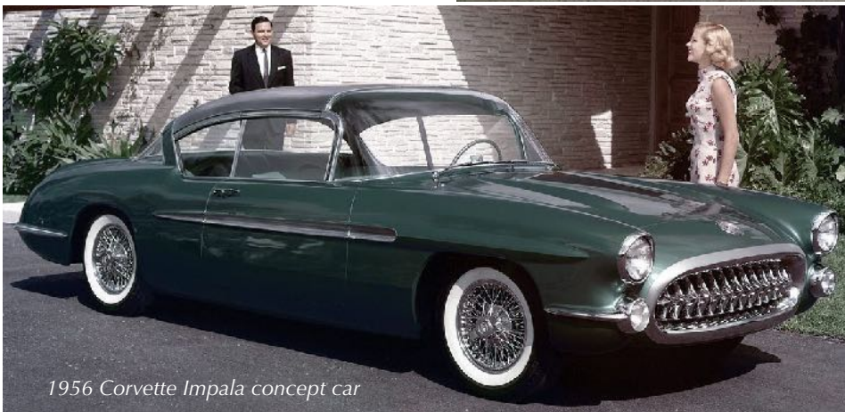
1956 Corvette Impala concept car