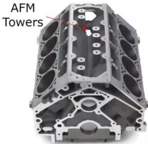
Figure 2 – LT1 Engine Block

All LT1 engine blocks have AFM towers and oil passages cast into them. However, they are only functional on engines that use AFM. There is no detrimental