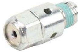
Figure 5 – Oil Pressure Relief Valve

The oil pressure relief valve is located on the oil pan rail and prevents excessive oil pressure from negatively impacting the AFM components. If you want to delete it entirely, use a M14 x 1.5 pipe plug.