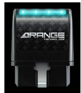
Figure 6 – AFM Disabler (Image – Range Tech.)

This is perhaps the simplest and most likely option most C7 owners will choose. An AFM Disabler is an electronic gadget that plugs into the OBD2 port under your driver's side dashboard. The AFM Disabler prevents the engine control module (ECM) from switching from V8 to V4 mode. It is an effective and simple method to turn off the AFM system and provides the added bonus of always immediately having the full V8 power and that great exhaust sound you all love. But... Engines with AFM use a high-volume oil pump since the valves for the disabled cylinders are disconnected from the valve train using oil pressure and flow. When you disable the AFM system, the extra oil is no longer needed. Excess oil (due to high oil pressure) will be pushed out from the oil