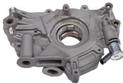
Figure 4 – LT1 Non-AFM Oil Pressure Pump

The oil pump on each LT1 engine with AFM is a high volume oil pump. The AFM two stage pump should be replaced with a standard volume oil pump. This will alleviate the need for the oil pressure relief valve and prevent other potential issues with it when AFM is deleted.