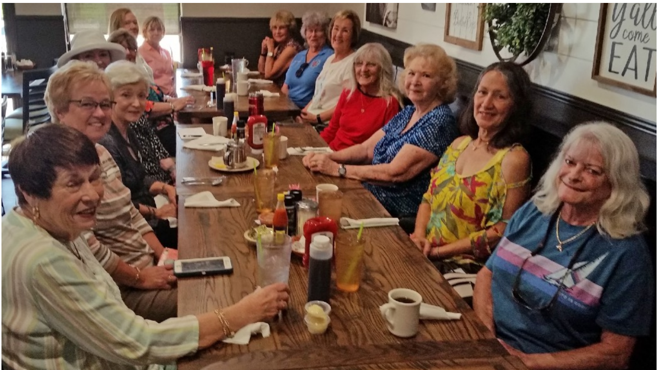
July 21 at the Country Cookin' Diner in Port St. John

location is chosen for the following month. Look for the email from me sent 10 days prior to the breakfast and RSVP is you'd like to join in.