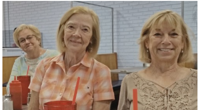
June 16 at The Pancake House in Rockledge

members and the CKCC Ladies Breakfast evolved. We usually have 15 or so attending and enjoy meeting and getting to know each other. We meet at 9:30 a.m. on the third Wednesday of each month. At breakfast a