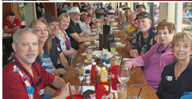
Photos: March Brunch at Fishlips