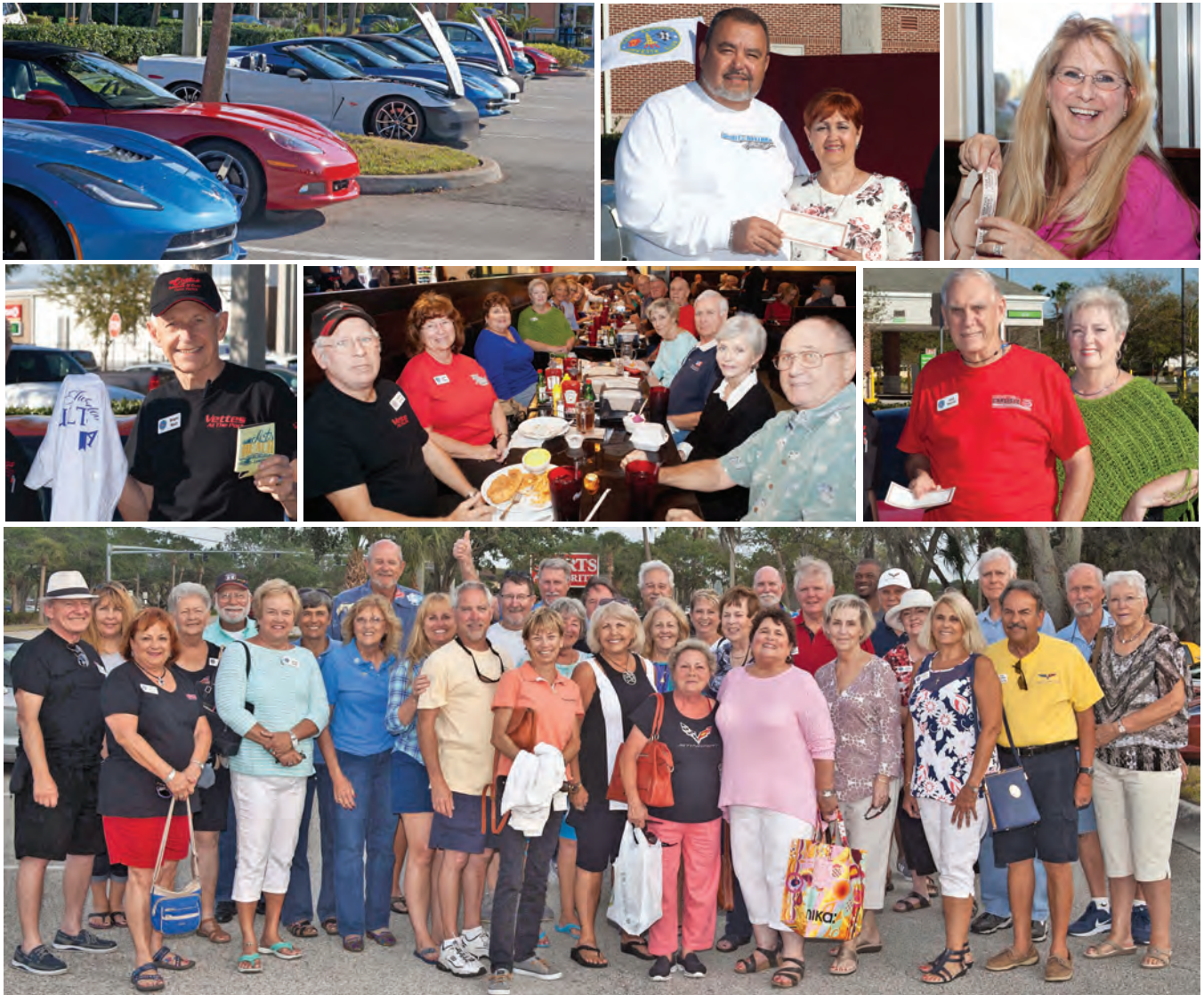
Group at Duffy's

Approximately 50 members of CKCC participated in the club's April cruise-in to Duffy's Sports Grill in Melbourne on the 22. Normally CKCC cruise-ins are held on the second Saturday but due to Easter this one was moved to the third Saturday. Duffy's is a nice easy to access location across the street from the Melbourne Mall. Not only was the food excellent with a staff ready to serve us in a timely manner, management also had reserved an area for us park our cars in a Corvettes only section.