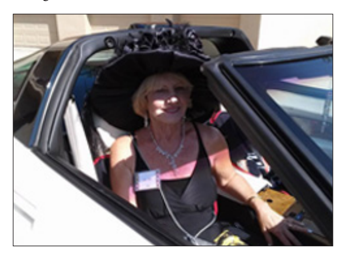
One of the ladies in her derby hat enjoying the ride

Members of CKCC helped celebrate with The Run for the Roses by participating in the parade on May 7 in Cocoa Village. This is a charity event designed to raise money for activities at the Cocoa Village Playhouse. Monies raised pay for children's events at the theatre especially during the summer. Those attending pay to ride in the Corvettes around The Village.