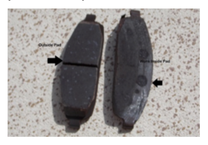
Brake pads showing extreme wear on one pad

I recently had a 2005 Jeep Grand Cherokee in my shop to replace front brake pads. The owner said that it had started to squeal and it was time for pads. We both thought this would be a quick job until I looked at the pads on the side making the squealing noise. One was like new and the other had worn grooves into the rotor disc and started to wear into the brake pad metal backing plate on one end and the friction material was barely there on the other end. This lead me to suspect that one or both of the caliper guide pins had frozen in place.