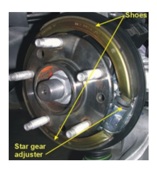
C5 parking brake

So this is a little preventive maintenance, do not use the parking brake if leaving your Corvette for an extended period of time. This also applies to drum brakes as well; in fact they might be more likely to rust in place. Many Corvettes that have disc brakes have drum parking brakes located inside the rotor disc and some can be a bit tricky to replace. This is another reason to DRIVE YOUR CORVETTE, OFTEN! Corvettes with floating calipers have guide (slide) pins that are used to slide the inner pad to the spinning rotor disc and form a clamping action with the outer pad (see photos below).