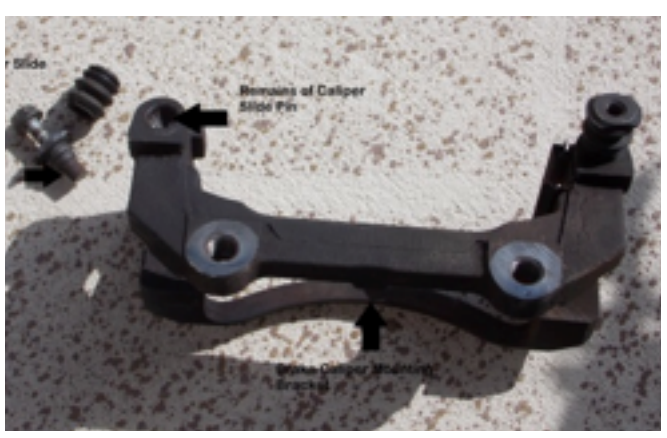
Caliper mounting bracket showing frozen guide pin

To make a long story short, one of the pins had indeed frozen and was literally rusted in place and could not be removed. This required the replacement of the caliper mounting bracket, which was as you might expect, on back order. I found that the other side had a frozen pin as well and so what started out as an hour and half job was taking much longer. We decided to find used brackets, which made for a faster job. We now know where all of the used parts facilities are between Titusville and Orlando.