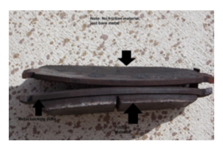
One brake pad with no friction material and one good pad

To make a long story short, one of the pins had indeed frozen and was literally rusted in place and could not be removed. This required the replacement of the caliper mounting bracket, which was as you might expect, on back order. I found that the other side had a frozen pin as well and so what started out as an hour and half job was taking much longer. We decided to find used brackets, which made for a faster job. We now know where all of the used parts facilities are between Titusville and Orlando.