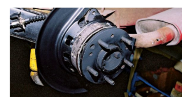
C2 and C3 parking brake

If your Corvette spends any extended time without being used, it is a good idea to block the tires and not use the parking brake. If your Corvette or OTC (other than Corvette) has sat over a few days, take a look at the rotors, they will most likely have light surface rust on them. This will quickly be worn away as you drive the first few feet or during your first brake application. However, when your Corvette (or OTC) sits for an extended period of time this rust can build up to the point that if the parking brake is engaged, it may be difficult if not downright impossible to break free without causing damage.