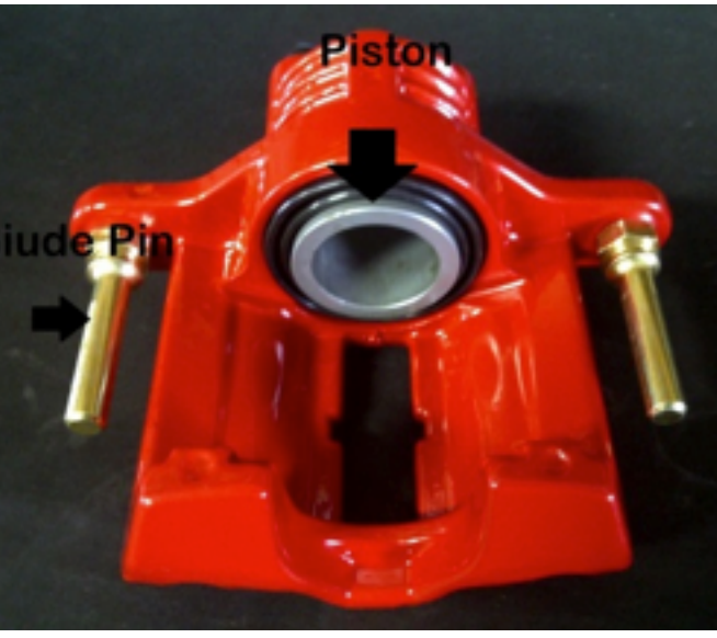
This guide pin also is used to mount the caliper to the caliper mounting bracket. This pin must