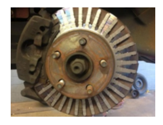
Rotor disc worn into cooling fin area