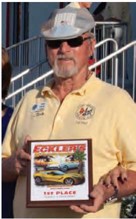
2017 Eckler's Show C7 1st. Place - All Chevy & Truck Show

"You're saving me for last – this is not good," Fitch said. He suspects there may be one more surprise.