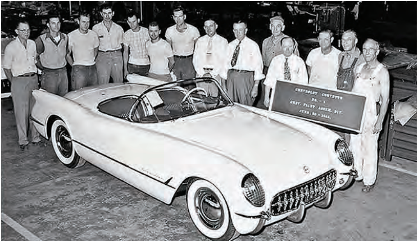
Factory build team with first Vette

of GM's traveling Motorama display at the Waldorf Astoria Hotel in New York City. The sleek Corvette, the first all-fiberglass-bodied