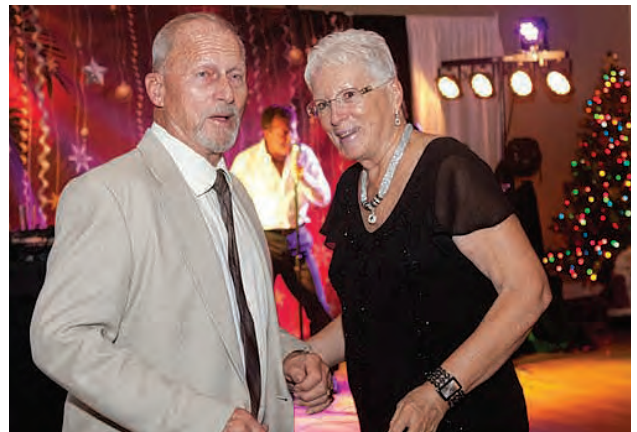
2017 CKCC Christmas Party