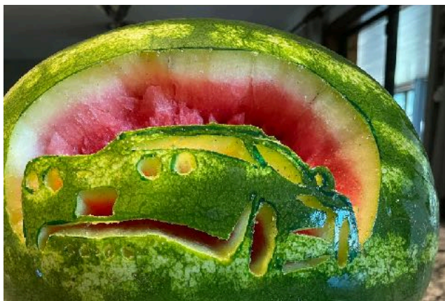
C6 Corvette carved out of a watermelon for display