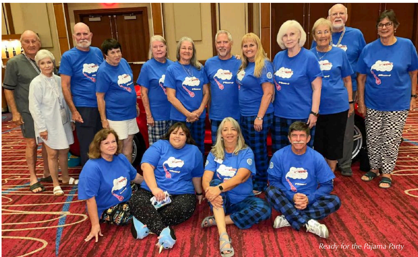
Ready for the Pajama Party

Next Year the Convention will be back in Bowling Green. I apologize for not keeping my big house there for all of you to come and stay but if you get your reservations in early, I understand the hotel is reasonable and will have breakfast included.