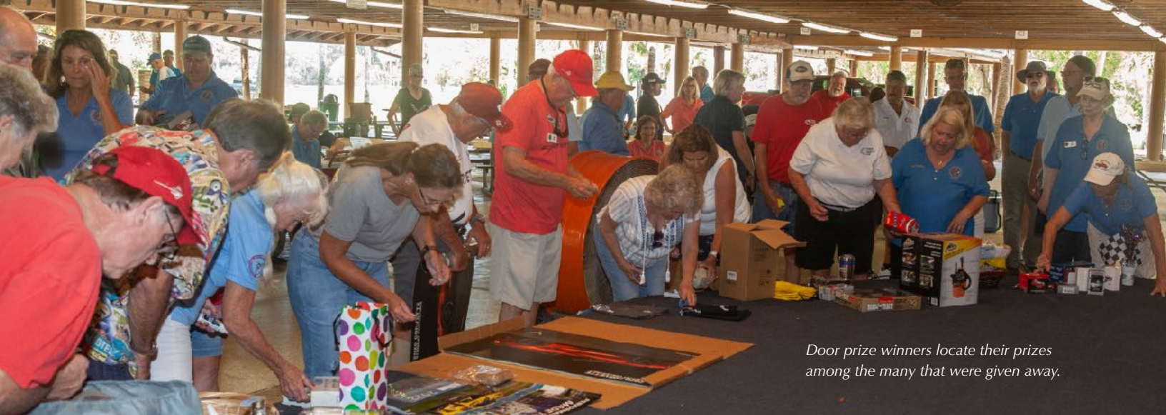
Door prize winners locate their prizes among the many that were given away.