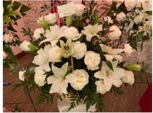
CKCC flower arrangement