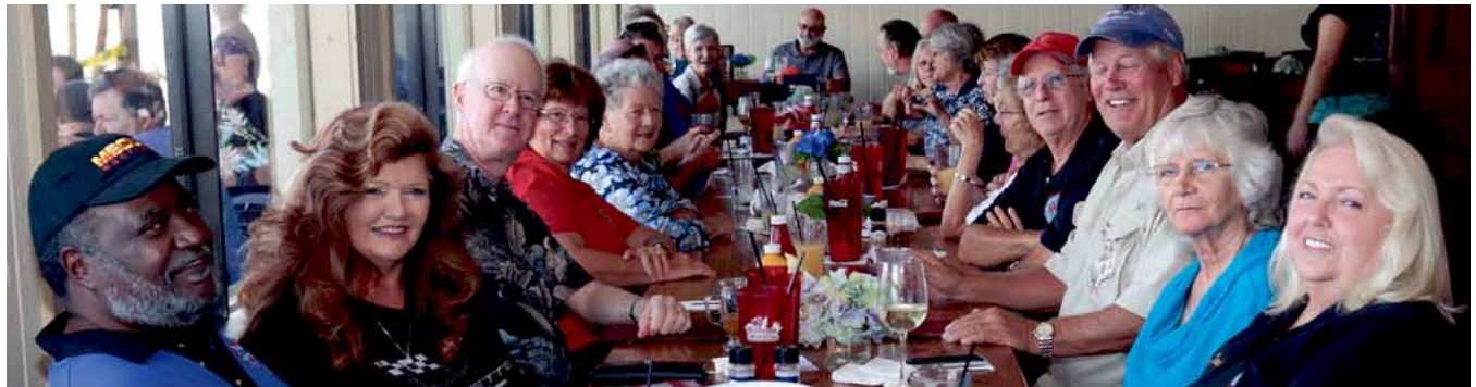
Above: November at Fishlips