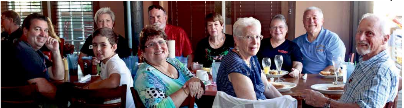
Below: December at Rusty's