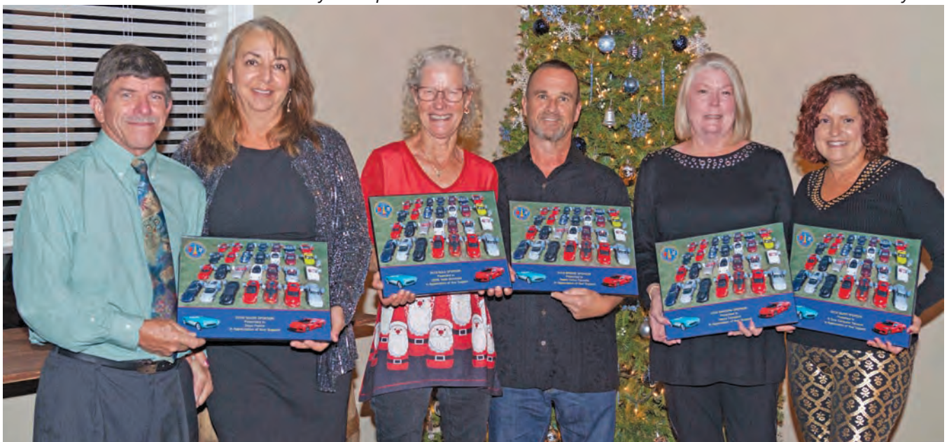
Sponsoring firms, L-R: Duys Marine Electronics, USSG, Stan's Cocoa Corvette, 317-55-11 LLC, N Synch Computer Systems