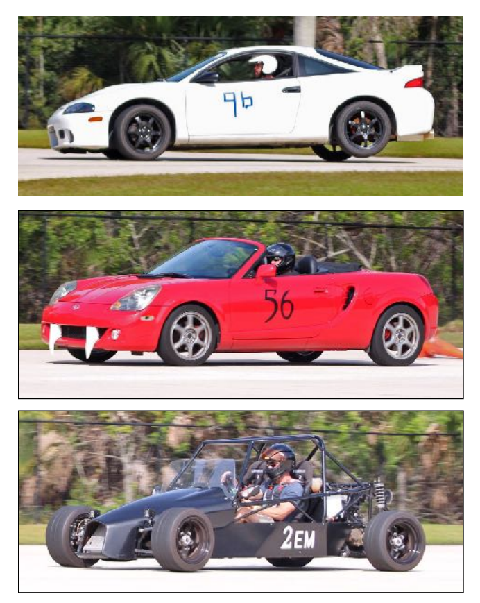
Page 10 Continued on next page

We have had so much support from the metal car community, which helps us financially to be able to host these events.