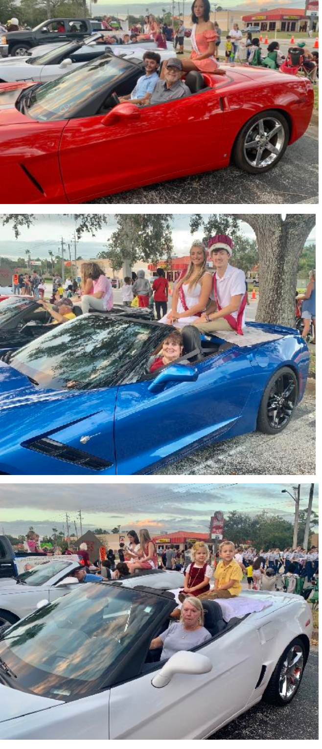
Page 12 Continued on next page